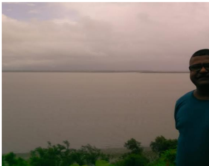
Naf River. Rohingyas crossed this river from Myanmar (the far side) and came to Bangladesh (this side) to seek refuge.